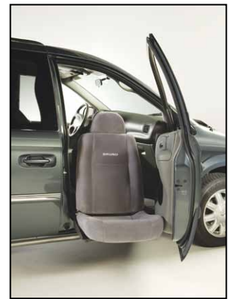
VALET SIGNATURE SEATING

Founded over 25 years ago, Bruno Independent Living Aids, Inc., is a world-wide manufacturer of accessibility products designed to enhance the lives of those challenged by limited mobility. In pursuing this goal, Bruno is proud to be the only U.S. manufacturer of indoor/outdoor stairlifts, interior/exterior scooter, powerchair and wheelchair vehicle lifts and vehicle seating products to be ISO 9001 Certified. This is one of the most stringent, widely-recognized quality standards in the world and your assurance that Bruno is committed to providing you with the highest-quality, most reliable products in the industry. Ask your certified Bruno dealer for details on all Bruno independence products.