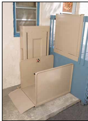
VERTICAL PLATFORM LIFT

The only 400 lb/181.8 kg capacity outdoor stairlift... an INDUSTRY EXCLUSIVE!